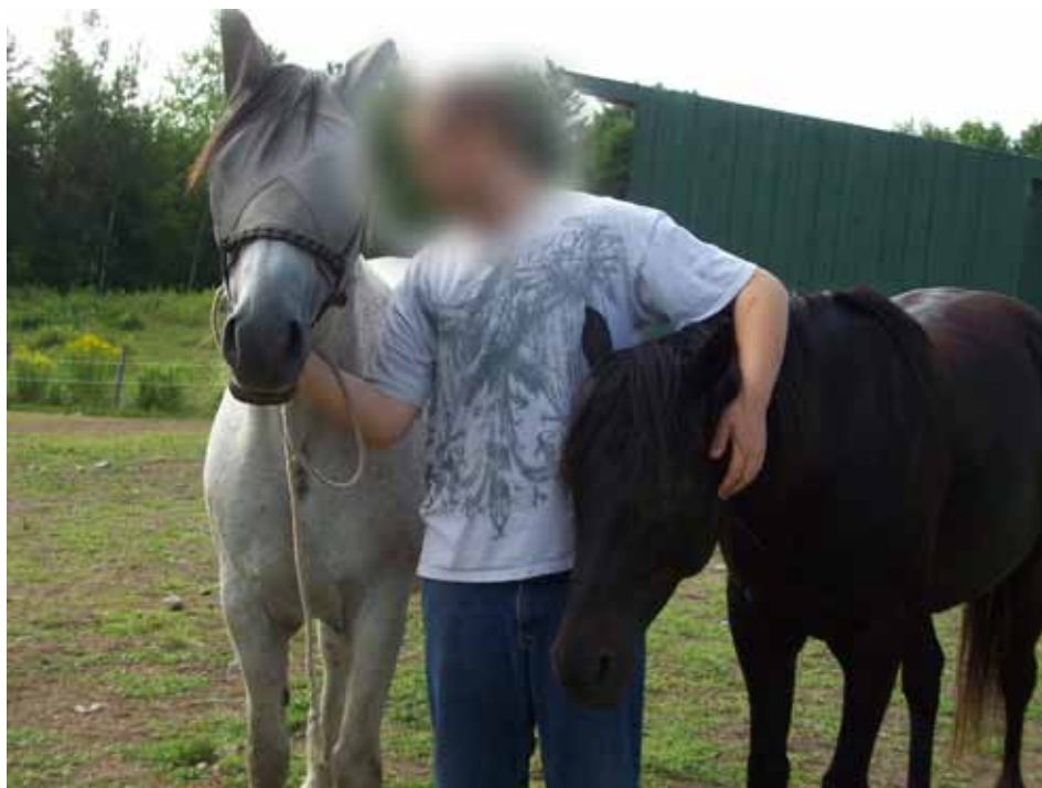
Mountain View youth participate in an equine program at Northern Maine Riding Adventures in Garland, Maine.

clean pasture and stall; and working with feel —using all the senses to understand the language of the horse. Our youth have a lot of emotions, which in part, are expressed through their body language. When they’re around these sensitive animals their emotions can easily impact the